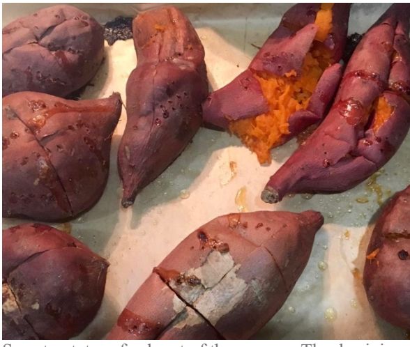
Sweet potatoes fresh out of the oven on Thanksgiving Day.

During the food distributions over the last several months, I've been struck by the number of kids who have lost a parent or are living with relatives with minimal capacity to support them through this crisis.