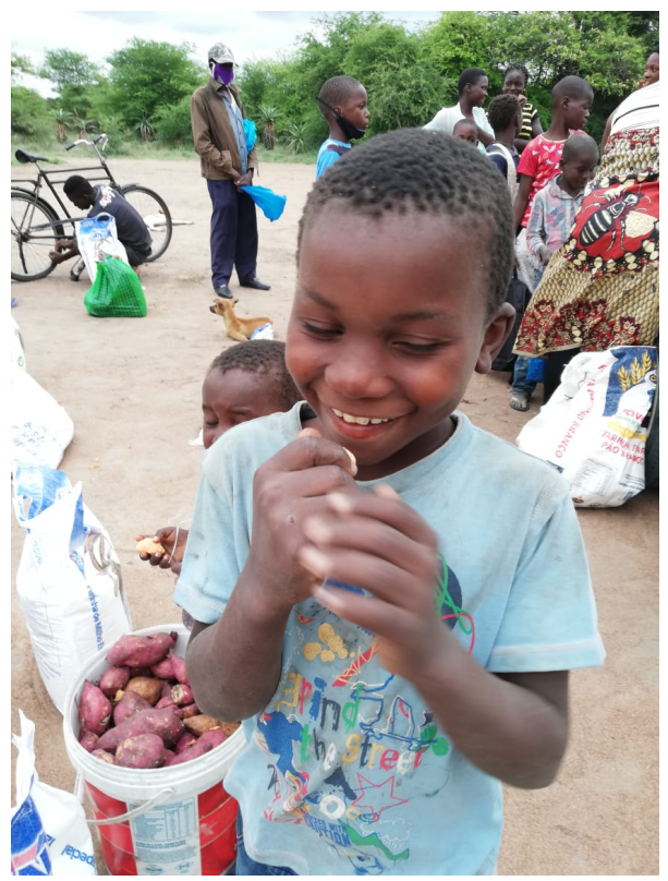
A student munches on a raw sweet potato from his food basket.

This year, we have much to be thankful for at the Mozambique School Lunch Initiative. It has been a very challenging year, with the COVID-19 crisis hurting many families. But thanks to your support, MSLI has been able to distribute food baskets to the 1,112 students at our six schools for the last eight months in a row! This adds up to the equivalent of 727,650 meals provided.