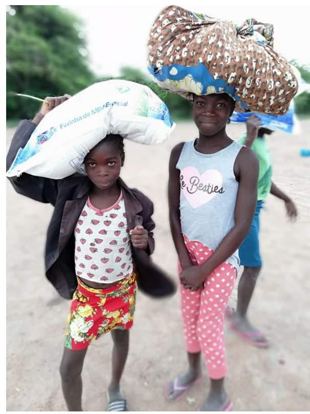
Students carrying their November food baskets home from school.