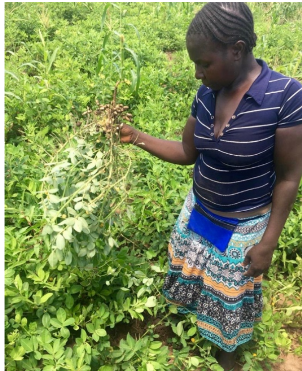
A farmer in Chate checking on her peanut crop. Over the last month, farmers have been harvesting peanuts and they will soon be ready to sell to the school lunch program!