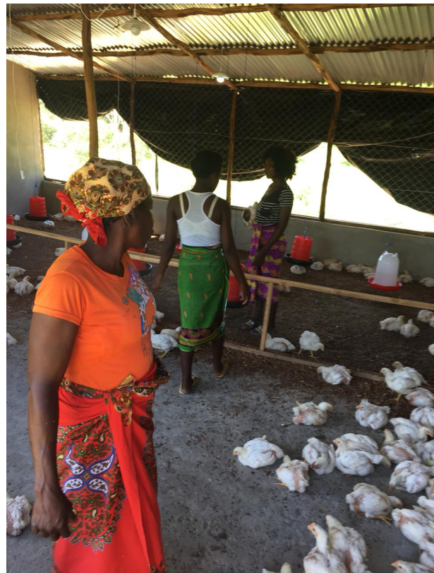
The farmer group from Bombôfo preparing chickens for sale from the new coop. Starting soon, MSLI will be purchasing hundreds of chickens every month from this group.