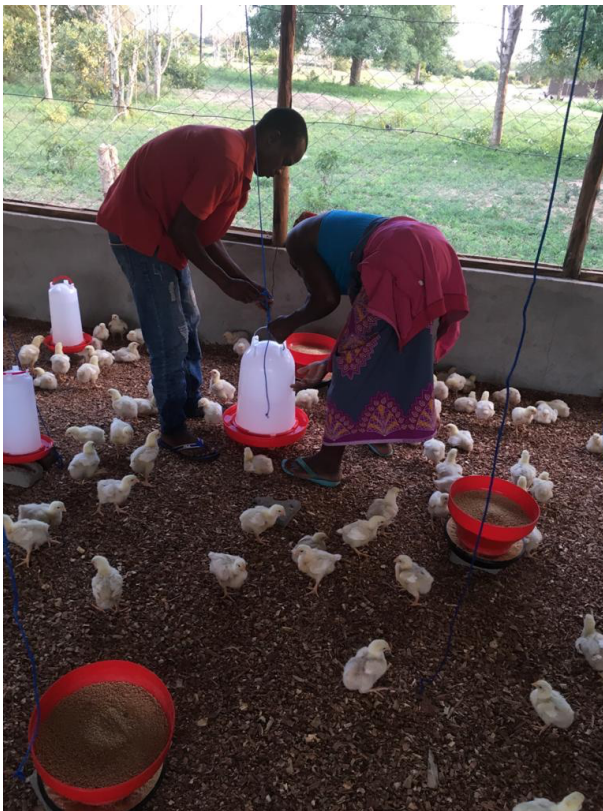
The new Bombôfo group is learning how to raise chickens with proper nutrition and sanitation protocols to ensure top quality!

After building the chicken coop (which is lit by solar power!) and training a group of five farmers, the first batch of 300 chickens was raised in December, just in time to sell for New Year's celebrations! The farmer group is saving a portion of the profits from each round to increase the number of chickens. In the second batch, they raised 370 chickens, and in a couple months, they will reach the coop's capacity at 500 chickens. A chicken sells for about US $3.25, of which $0.80 is profit for the farmer. At capacity, this project will generate US $400 in profit every six weeks, a major boost for the farmers involved.