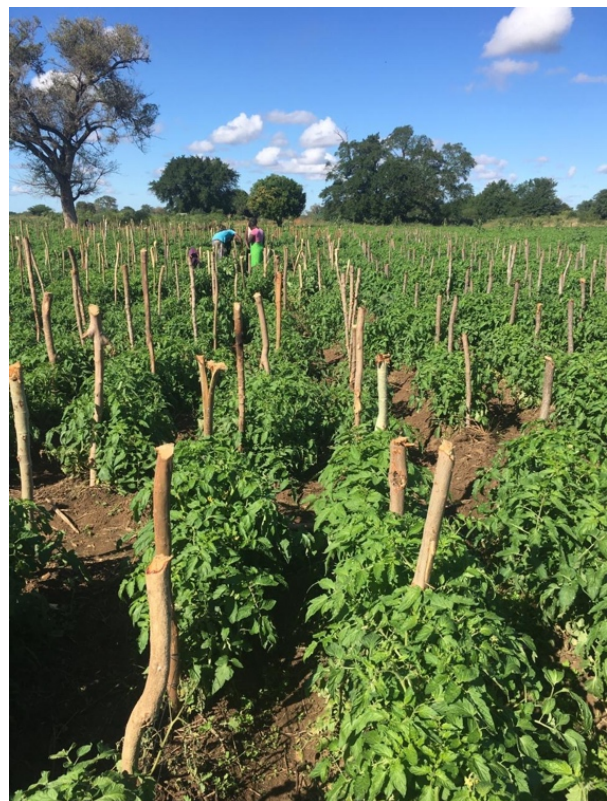
A large plot of tomatoes thriving at the new farm in Chate B last year.