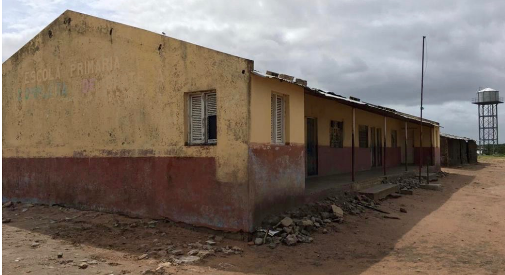
Chate A Primary School, the seventh school in MSLI's program, has about 500 students in grades 1-7.