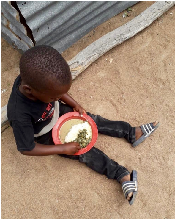
A student savoring his school lunch, peanut vegetable curry with xima (corn porridge), just before schools closed last year.

*The number of meals served in 2020 was dramatically higher in 2020 due to the fact that the monthly food baskets provided from April - November contained the equivalent of around 110 meals per student (not the monthly 20-22 meals through the regular school lunch program). This is because at home, the food is typically cooked and shared with all of the student's family members as well. In order to ensure that each student still got the nutrition they needed, we increased the rations per food basket substantially.