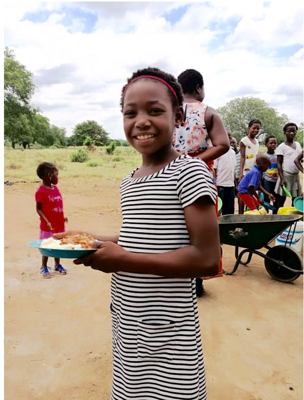
A girl with her school lunch last March. We're looking forward to serving school lunches everyday again!

We are also expanding our program to include a seventh school – Chate A Primary School. This school has a little over 500 students, bringing our total up to around 1,700 from just under 1,200 in 2020. We are really happy to be able to expand at such a critical moment and serve school lunches to more kids.