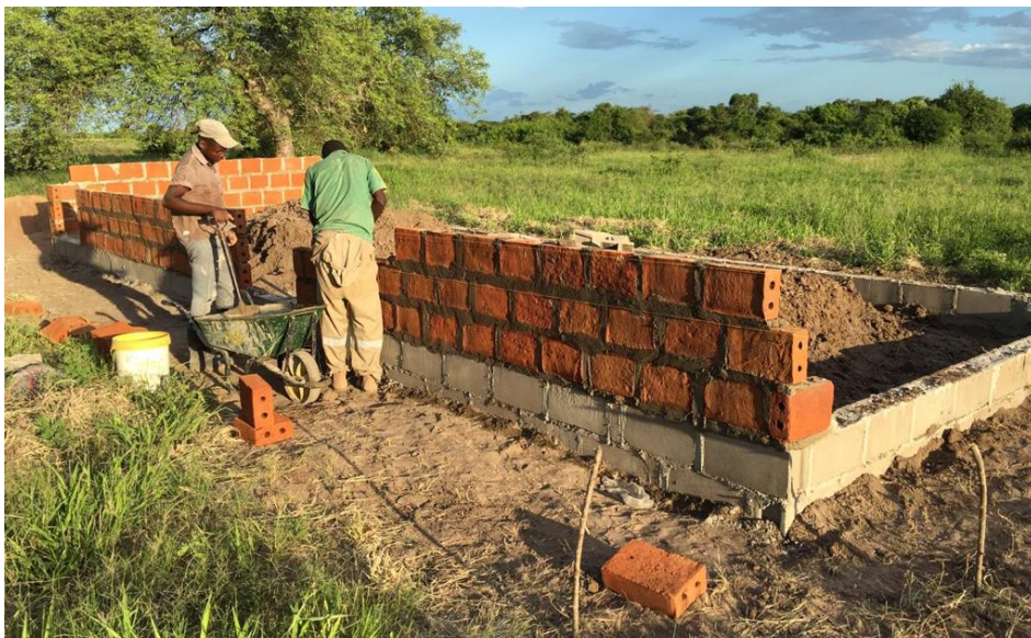
Construction of the preschool building near Duvane Primary School.

In order to address the needs of younger children, this year MSLI is launching community preschools alongside two primary schools where we currently serve school lunches: Duvane and Bombôfo. We expect to enroll 200-300 preschool students, ages 3-5 years, across these two schools. The preschool will help younger kids develop the key skills they need to be ready for school. This is especially important in rural areas of Mozambique where many kids grow up without any exposure to the Portuguese language – which makes it really hard when they get to first grade and all school instruction is in Portuguese (the national language of Mozambique). And of course, the preschool kids will also get a delicious and nutritious school lunch each day! We are hoping that by reaching these younger kids, we can go even further to prevent early childhood malnutrition.