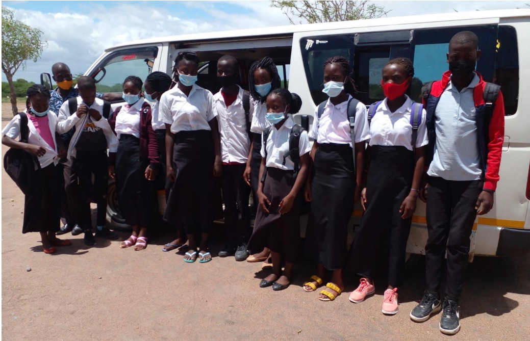
High school students preparing to board the school bus in Chate village.