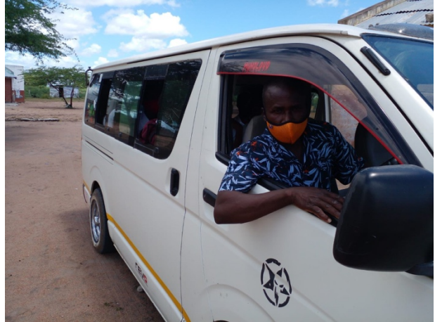
A bus driver departing from the pick-up point near Cumba Primary School.