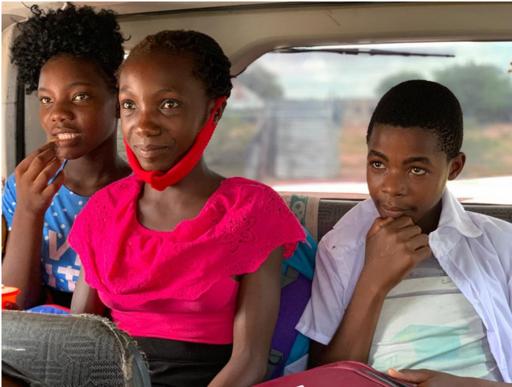
Students on the Cumba school bus heading to secondary school.

Furthermore, many students who had dropped out of secondary school have reenrolled thanks to the school buses. In addition to the 46 eighth grade students who passed seventh grade in 2021, we are also transporting 45 eighth graders from other years (who had previously been out of school), 28 ninth graders, 19 tenth graders, and one eleventh grader. In the coming years, we expect the school bus to greatly contribute to secondary school retention and completion rates by making it easier for students, especially girls, to go to school. In total, almost two-thirds of the students using our school buses this year are girls!