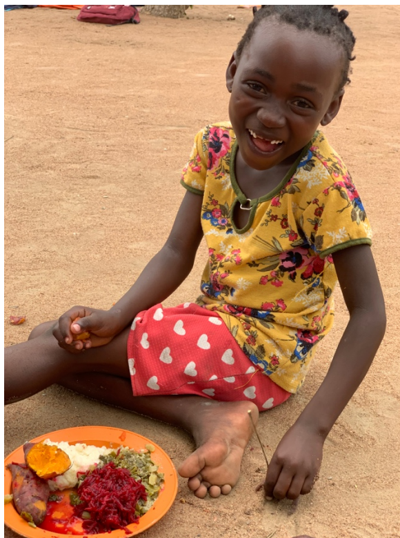
A student having lunch at Duvane Primary School.

As always, we are grateful for your support in making this work happen! We are also thankful for the incredible team in Mozambique, including the management staff, the cooks, the preschool teachers, the mentors, the farmers, and everybody who contributes along the way.