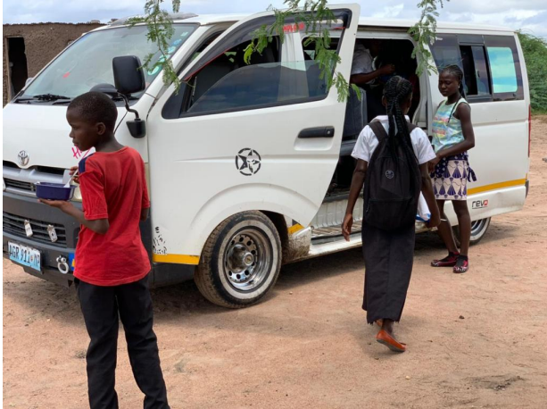
Students in Cumba village getting on the school bus.