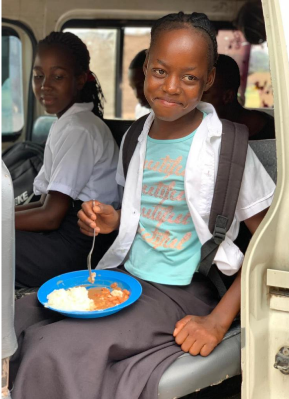
A student enjoying her lunch on the bus.