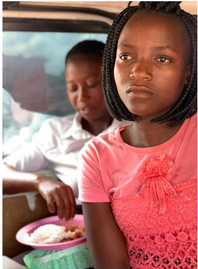
A student aboard the Chate school bus.

MSLI launched the first two school buses in February 2022, serving rural students from six primary schools. We hired two existing transporters (minivans and drivers), one to cover four primary schools (relatively smaller schools) and one to cover two primary schools (relatively larger). MSLI pays each bus driver $12.60 per student per month – a very cost-effective solution! The buses make multiple trips every day in order to transport all of the students. The students also continue to benefit from our school lunch program, receiving a hot lunch at their local primary school, which also serves as the pick-up and drop-off point for the buses.