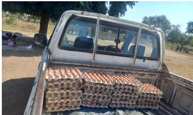
Loading MSLI's truck with eggs for the schools.