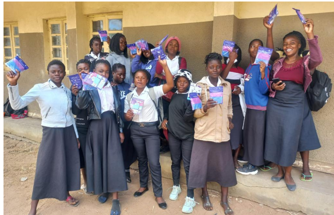
Secondary school girls excitedly showing off their BeGirl products last month.

Many adolescent girls lack the resources to buy menstrual products each month, and this interferes with their school attendance. In partnership with BeGirl, MSLI has provided menstrual hygiene products so the girls can better manage their monthly cycle and not miss school.