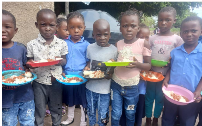
Children at school enjoying a boiled egg alongside their plate of bean stew and rice.