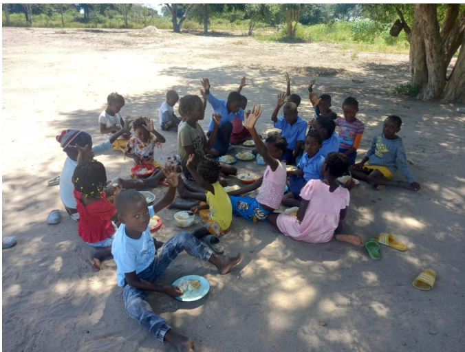
Students at Malouluane Primary School enjoying lunch under a shady tree!

We are excited to announce that we have expanded our school lunch program to an eighth primary school this year -- Malouluane Primary School. One of the teachers at this school used to be a teacher at another school where MSLI works, and he has been advocating for his new school to be included in our lunch program ever since he started. Thanks to the generous support of our donors, we were able to launch the school lunch program in Malouluane Primary School at the end of last month. Right now, there are just 25 students at this school, but we expect more to start enrolling now that there is the incentive of the school lunch program.