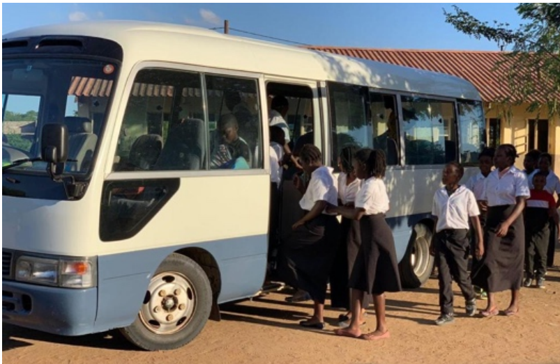
Students boarding MSLI's school bus to go to Manjangué secondary school.

Last year, we saw the critical role that the free school transportation service provided for students. And this year, the number of students jumped from 147 to 304! With this level of demand (and expected to grow further next year), the MSLI team decided to make this a priority investment. In February, after much searching in second-hand markets, we finally found and purchased our first school bus. And in May, we purchased a second! These 34-seater Toyotas provide a safe, reliable way for kids from rural communities to get to high school.