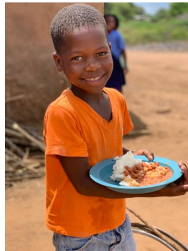
A second-grader at Malouluane with a hearty school lunch.