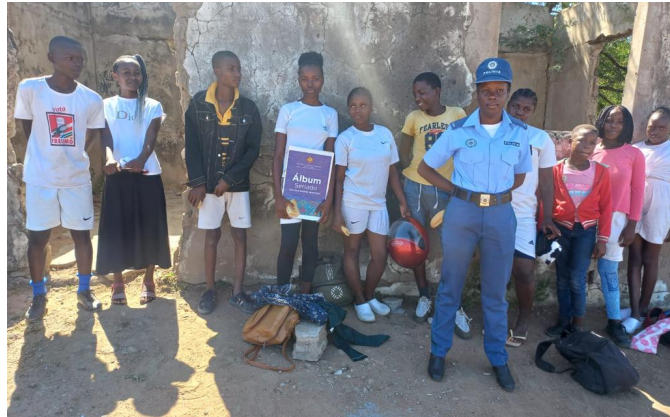
High school students engaging with a policewoman, invited by MSLI, to share about her career and journey.

Over the course of the school year, we are organizing professional speaker series so that students can have the chance to learn about job pathways and get inspired for their own futures. So far, we have had a police woman and a hospital technician come and speak with the students. The students loved being able to ask them questions.